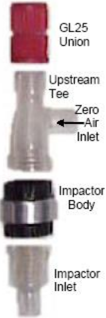
Figure 1. Tekran Model 1130, elutriator components.